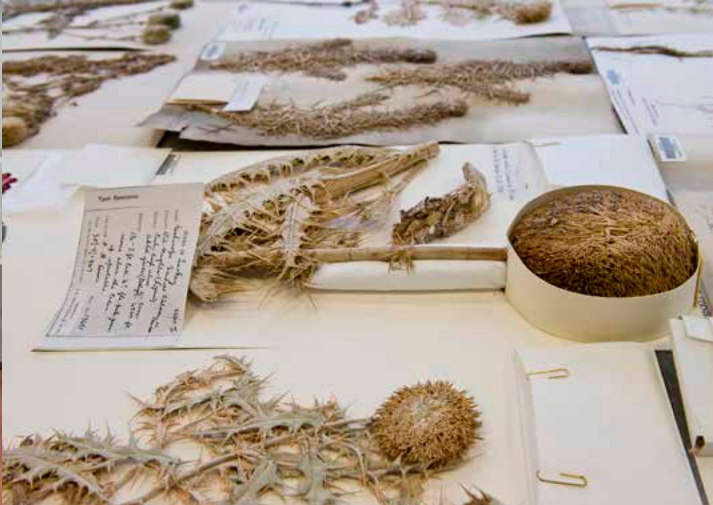
Above: The Herbarium at the Royal Botanic Garden Edinburgh has over 3 million specimens and is research archive of global importance.