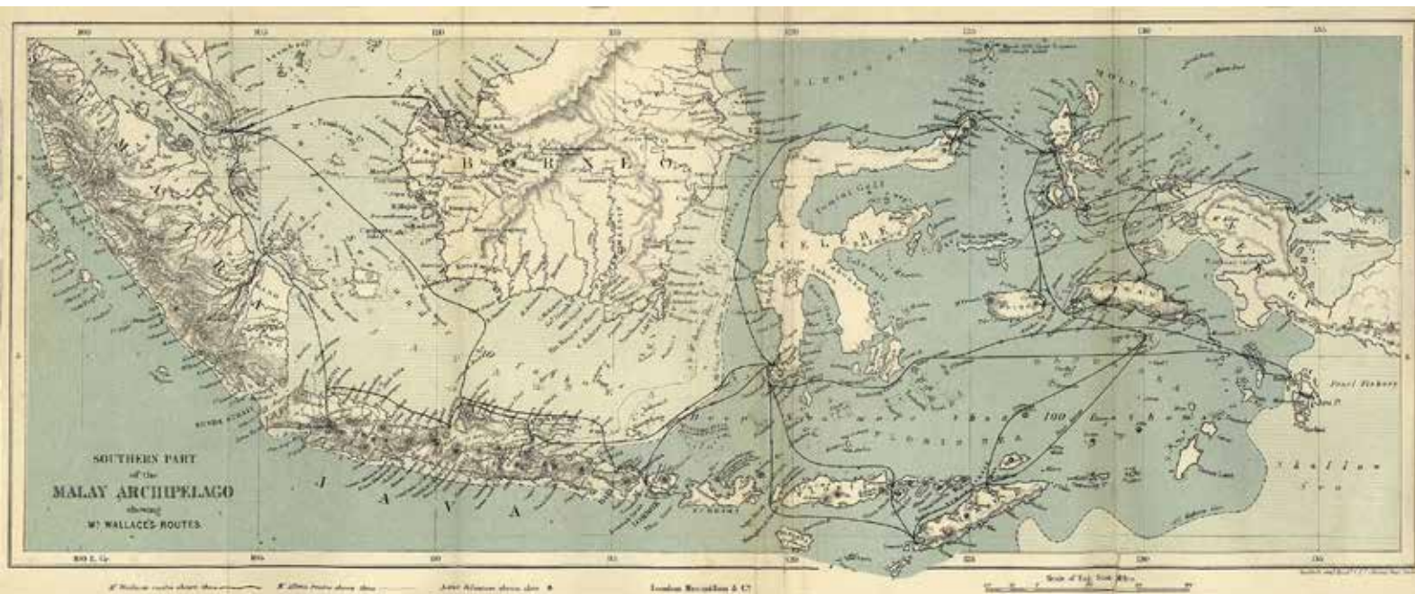
Below: Frontispiece map from The Malay Archipelago (Wallace, 1869)