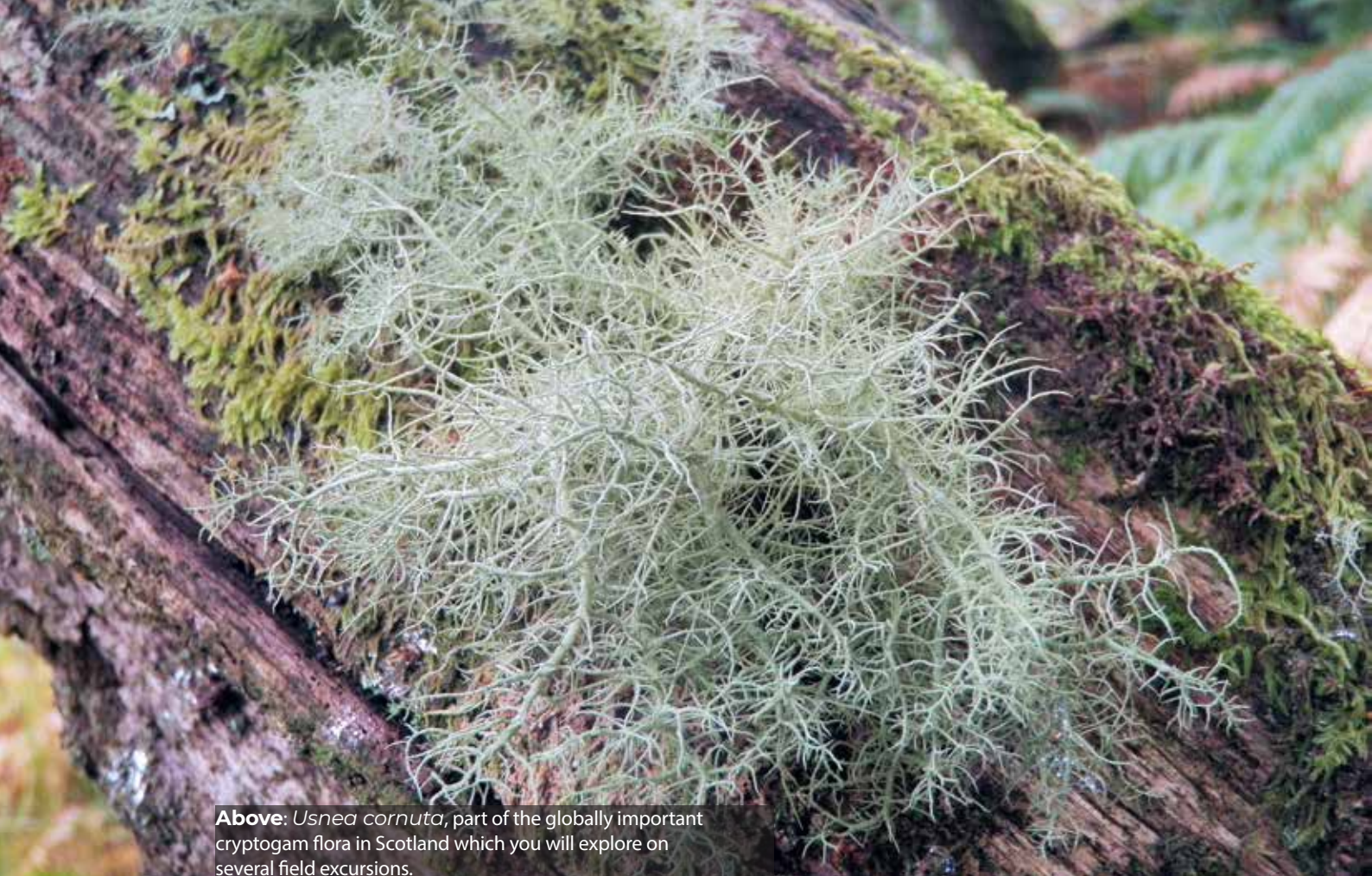
Above: Usnea cornuta , part of the globally important cryptogam flora in Scotland which you will explore on several field excursions.

The availability of living study material involves the study of plants as an entity and students are encouraged to explore these living resource, and record their observations by drawing half-flowers including floral diagrams and floral formulae, as an effective way to become acquainted with the diversity of angiosperm families. After completing this course in combination with the fieldtrip, you should be able to identify major plant groups by sight, mostly to family level. Assessment is through a specific essay at the start of semester 2 (50%), and a two hour practical examination using live material at the end of semester 2 (50%).