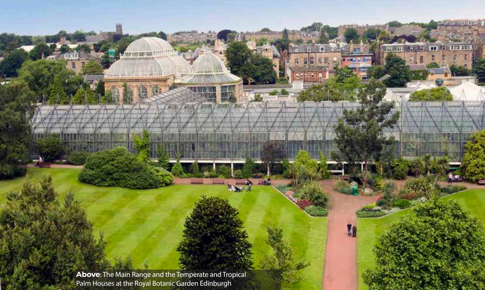
Above: The Main Range and the Temperate and Tropical Palm Houses at the Royal Botanic Garden Edinburgh