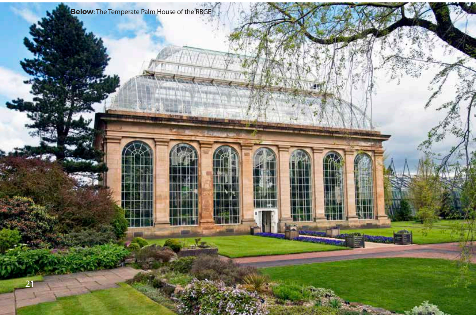
Below: The Temperate Palm House of the RBGE

In 1763, the garden moved to a 2 hectare site to the west of Leith Walk, which then ran through open country between Edinburgh and Leith. Sixty years later, however, it was beset with problems; glass-houses had become seriously dilapidated and the nursery had been built over due to the expansion of Edinburgh.