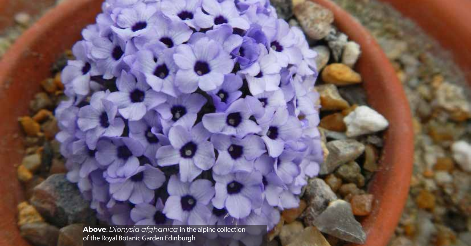
Above: Dionysia afghanica in the alpine collection of the Royal Botanic Garden Edinburgh

and evolution as well as their identification. The course relies heavily on the understanding of floral structures (through floral diagrams and floral formulae) and the identification of plants to family level using key characters. The evolution of angiosperms is reflected in the study of their floral diversity. The study of angiosperm diversity involves the sampling and observation of diverse living floral material grown at RBGE.