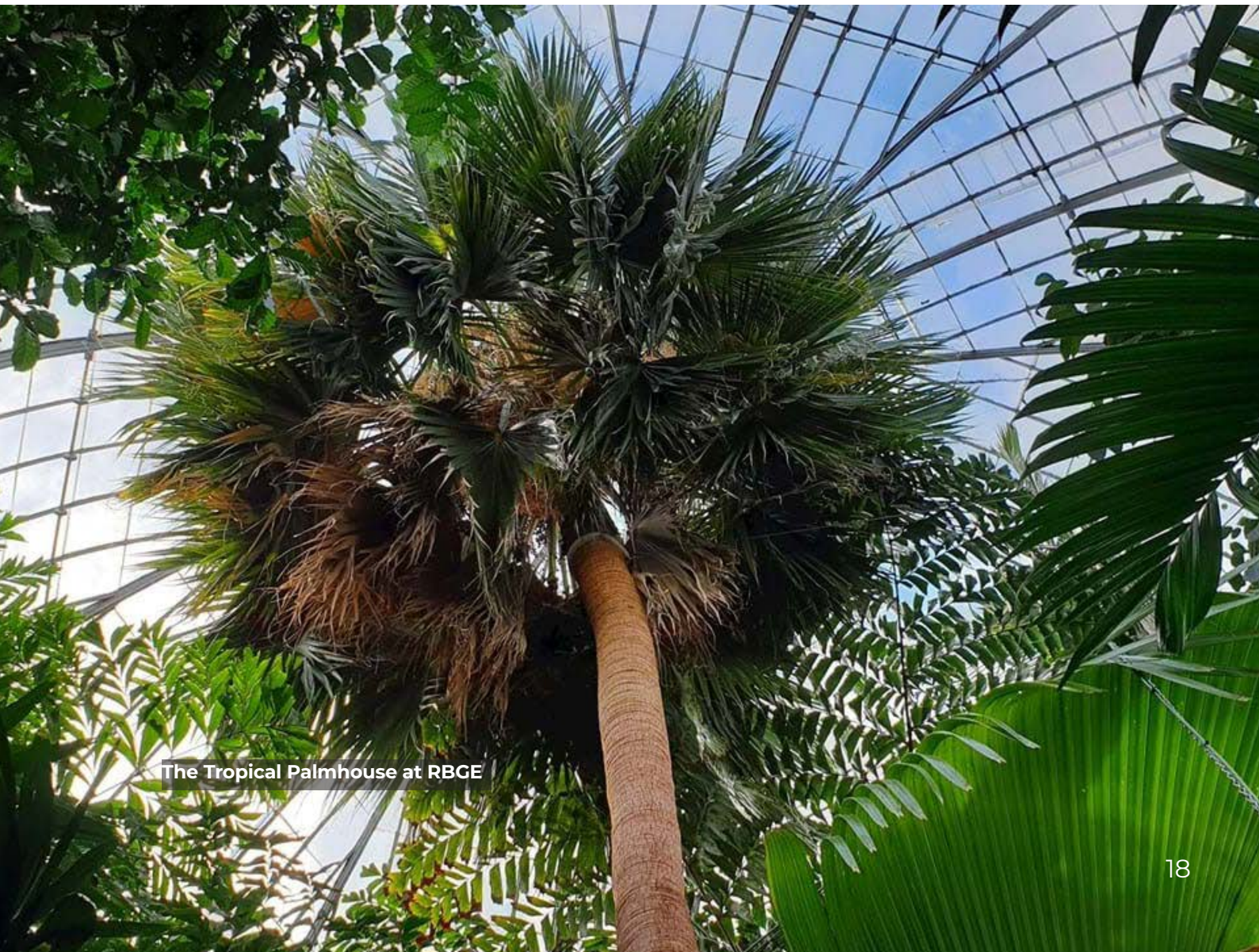
The Tropical Palmhouse at RBGE