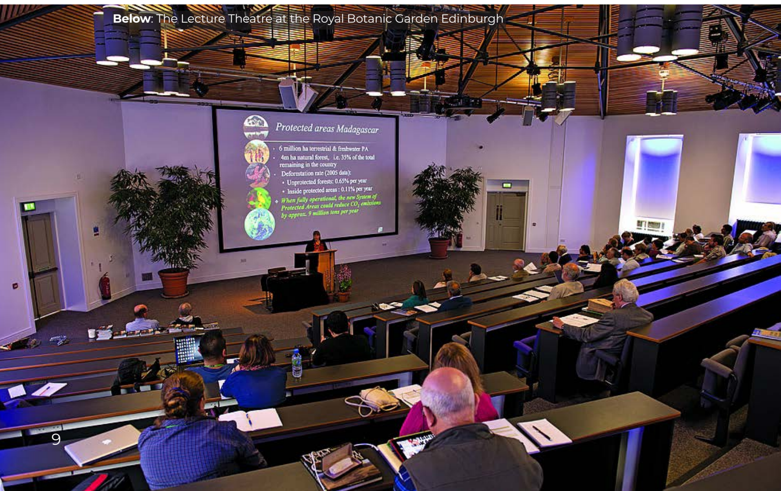
Below: The Lecture Theatre at the Royal Botanic Garden Edinburgh

The purpose of the course is to explain the origin, evolution and special features of the angiosperms to enable you to understand the relationships of major groups of plants. The lectures are provided in the context of the Angiosperm Phylogeny Group (APG IV, Botanical Journal of the Linnean Society 181: 1-20, 2016) and give a broad outline of the major clades and the evolution of key characters. The major