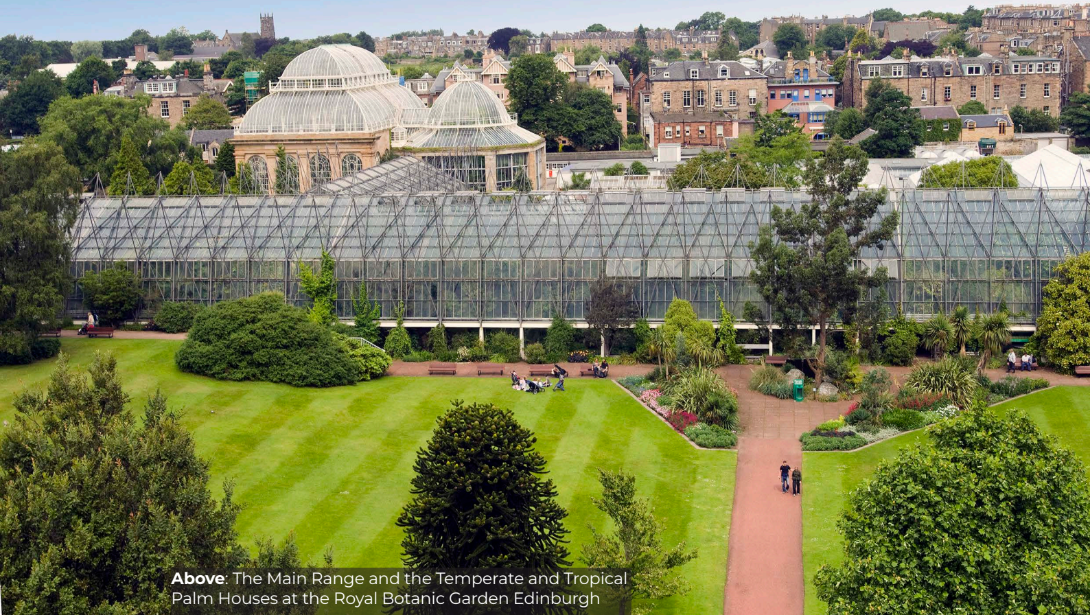
Above: The Main Range and the Temperate and Tropical Palm Houses at the Royal Botanic Garden Edinburgh