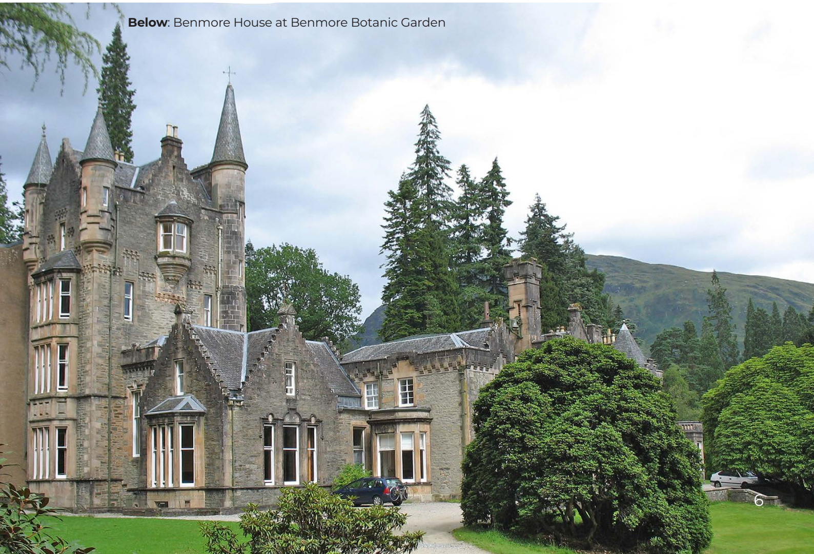
Below: Benmore House at Benmore Botanic Garden