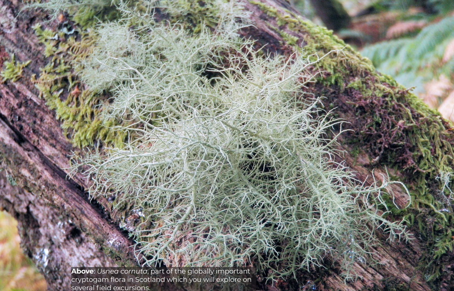
Above: Usnea cornuta , part of the globally important cryptogam flora in Scotland which you will explore on several field excursions.