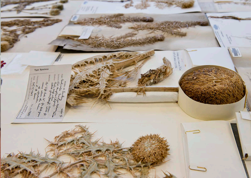
Above: The Herbarium at the Royal Botanic Garden Edinburgh has over 3 million specimens and is research archive of global importance.