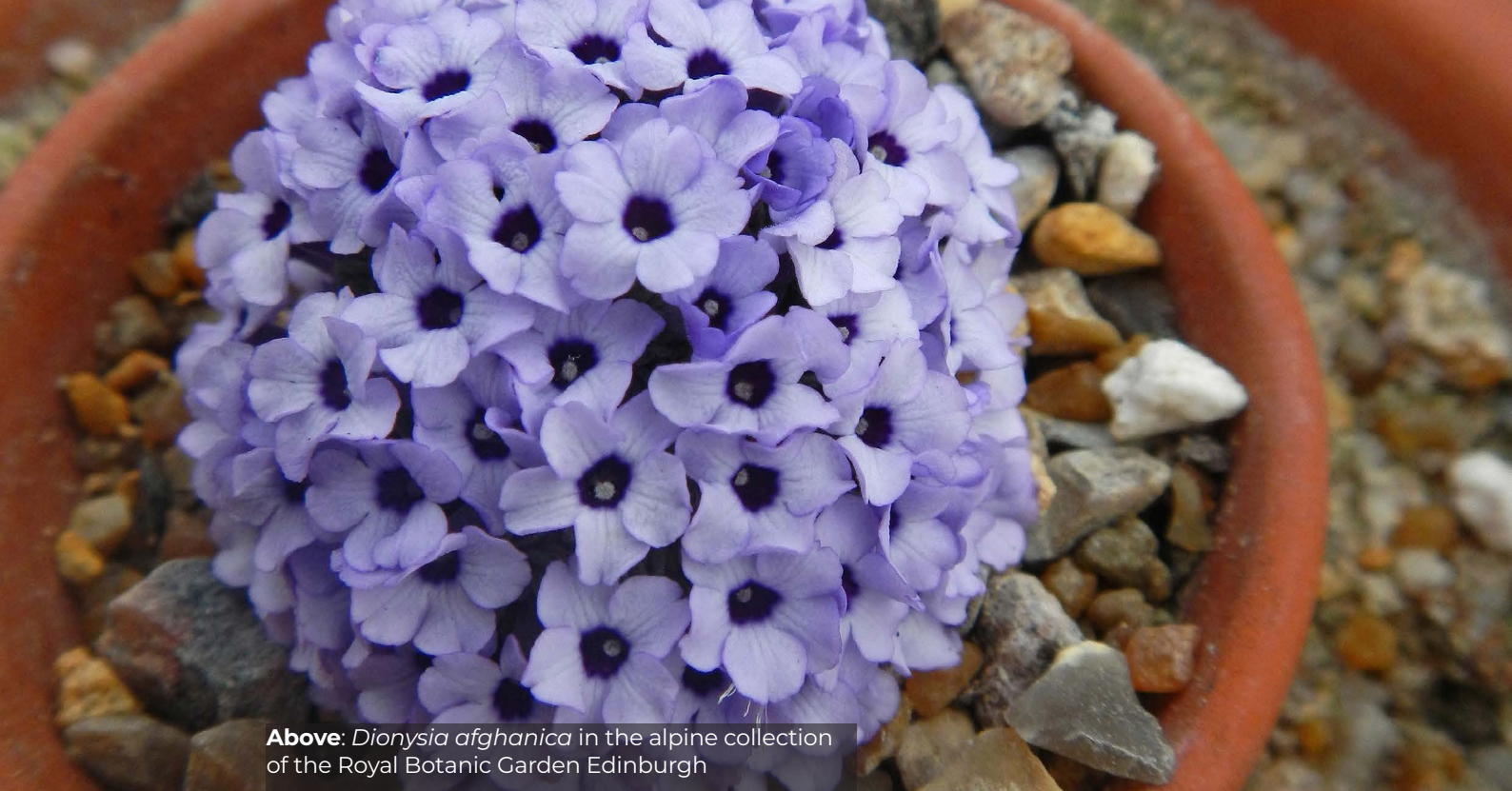
Above: Dionysia afghanica in the alpine collection of the Royal Botanic Garden Edinburgh

lineages of Angiosperms are presented with emphasis on major events of evolution and diversification. Further to this, the evolution of the angiosperms is approached from a floral structural perspective. Morphological characters linked to the flower are analysed and linked with the evolutionary developmental genetics underlying floral development. Other elements affecting floral evolution, such as pollination ecology, are presented. Throughout, full use is made of the excellent collections of living plants at RBGE. Twenty practical sessions spread throughout the year analyse the floral structures of the major orders and families of angiosperms. The practicals give the opportunity to extend on key characters based on further sampling and observation of living floral material grown at RBGE. The best way to become acquainted with the diversity of angiosperm families is through careful observation supported by drawing half-flowers including floral diagrams and floral formulae.