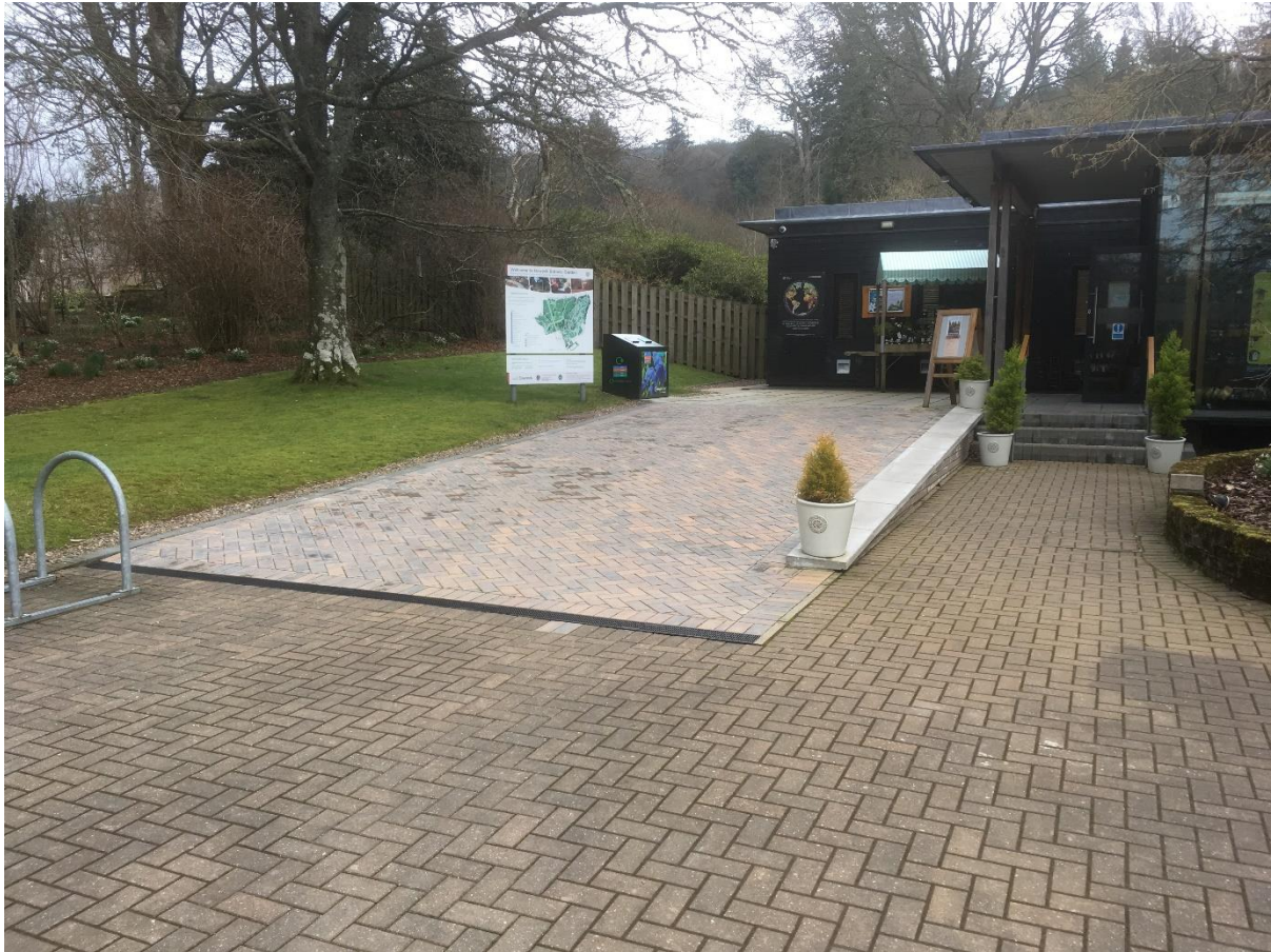
Above: The visitor centre entrance

The main entrance to the Garden is through the visitor centre and this can be reached by either a 10 metre long ramp with 1.5 gradient or three steps.