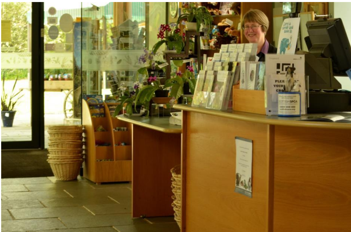
Above: The information desk, where you will receive a warm welcome, has a lowered section at the till point and a hearing loop.