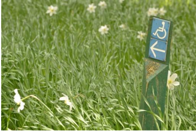
Above: Signage at ground or low level indicates wheelchair accessible paths.

A range of bench seating, with and without arm rests, is provided at intervals around the Garden in all locations. These provide visitors with an opportunity to take a break and rests with their companions.