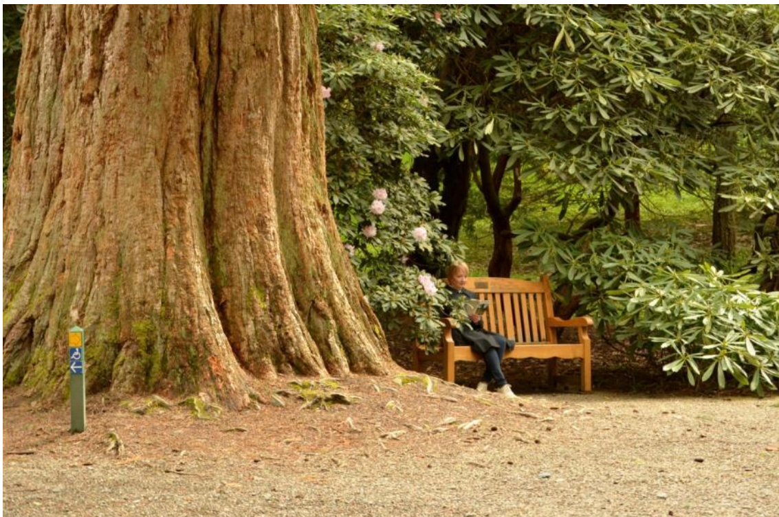
Above: Benches are positioned in many locations around the Garden.

A range of bench seating, with and without arm rests, is provided at intervals around the Garden in all locations. These provide visitors with an opportunity to take a break and rests with their companions.