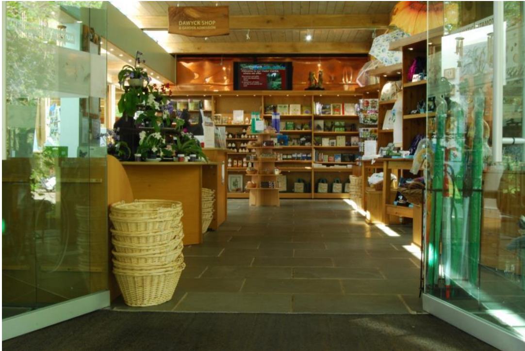
Above: The entrance is accessed through two automatic doors with push pad controls.