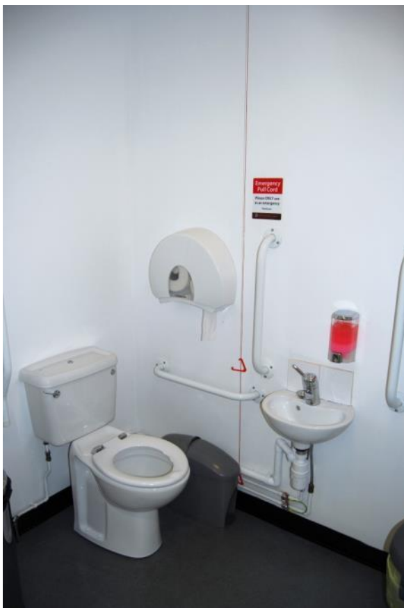
Above: The accessible toilet at Dawyck Botanic Garden