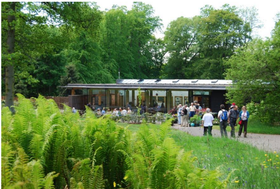
Above: The restaurant's outside seating area