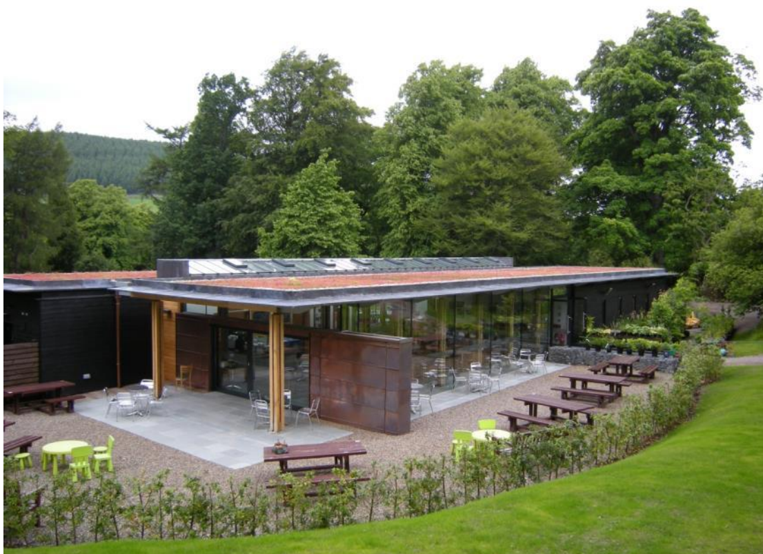
Above: A variety of tables and picnic benches are available outside the restaurant. Please ask for assistance if you require help with seating.