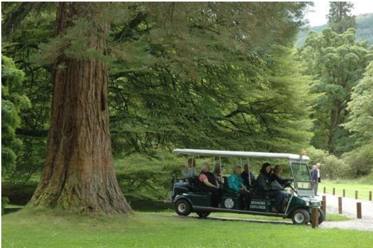
Above: The Benmore Explorer

The Explorer can accommodate up to seven visitors who have mobility difficulties. Wheelchair users would need to be ambulant in order to transfer onto and use this vehicle. Manual wheelchairs or mobility equipment can be carried on the back of the Explorer with the rear seats folded down.