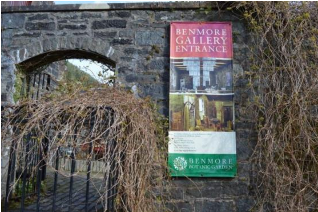
Above: Benmore Gallery Entrance with views to the cobbled Courtyard.

There is a platform lift (or five steps) to the upper level of the Benmore Gallery.