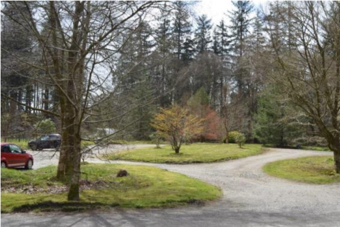
Above and below: The ample car parking facility at Benmore Botanic Garden