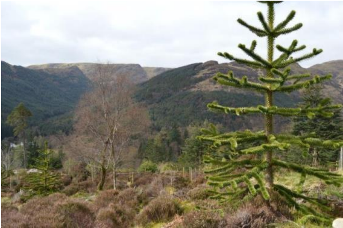
Above: Views from the Chilean Pavilion