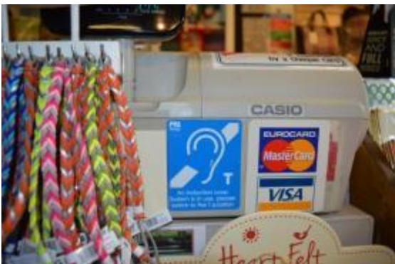
Above: Hearing loop at the counter.