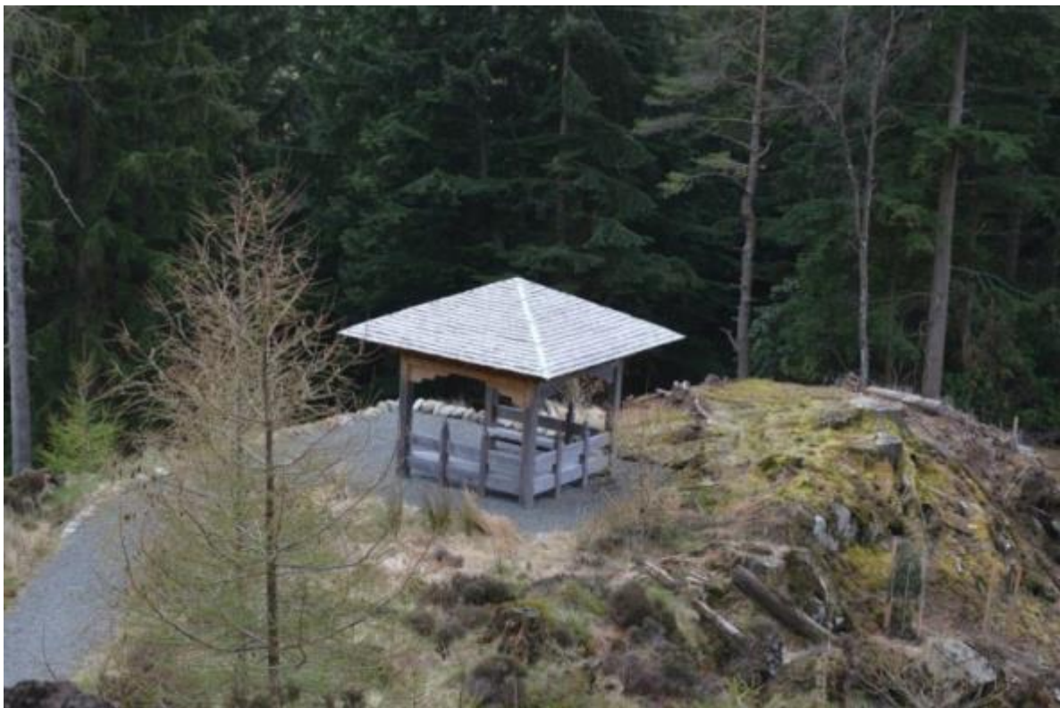
Above: The Bhutanese Pavilion