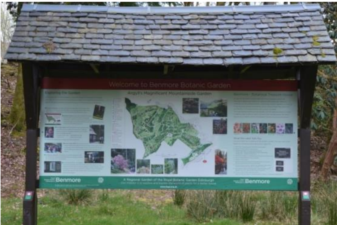
Above: Information panel at the Garden entrance.