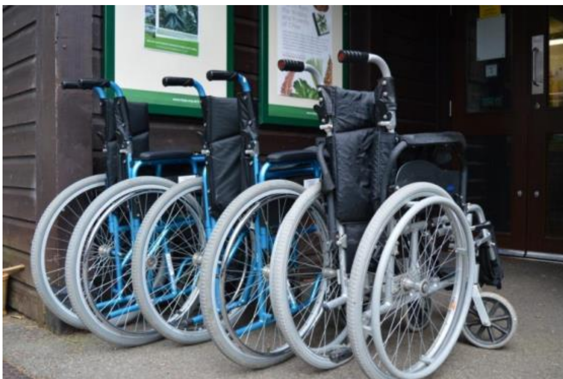
Above: The visitor centre has three wheelchairs for visitors to use. If possible, please book in advance by calling 01369 706261.