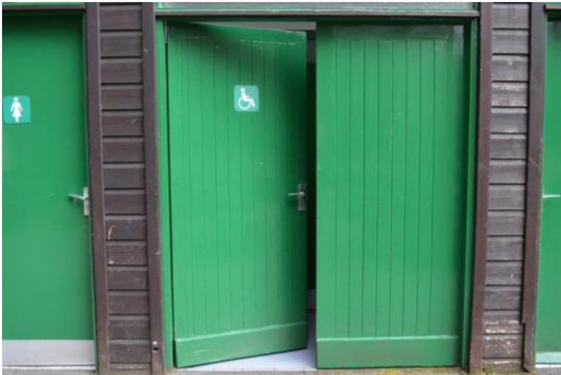
Above: Accessible toilet outside the visitor centre

There is an accessible WC located with other toilets just outside the visitor centre. A horizontal door bar on the hinge side aids closure. The doors to the WC are 170mm clear opening with clear space opposite the door. The floor space is 1500mm x 1200mm and there is 1000mm lateral transfer space to the right beside the WC.