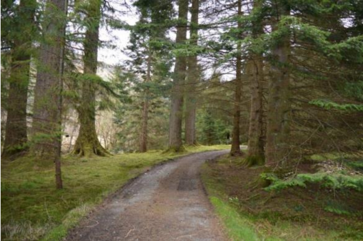
Above and below: Gravel paths on Benmore's accessible route. Note, that there are several speed bumps along the Easy Access Route.