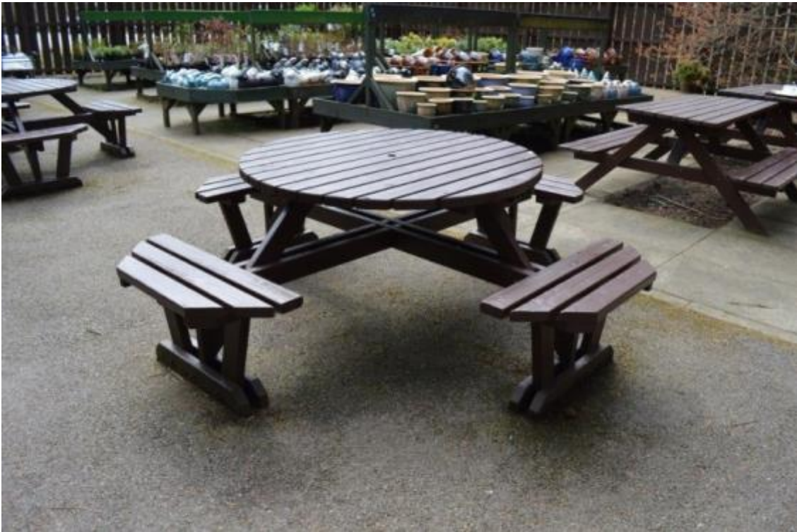
Above: Wheelchair accessible picnic tables outside the café.