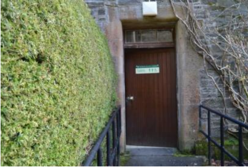
Above: Entrance to the accessible WC by the Courtyard Gallery.

The doors to this WC are 930mm minimum clear opening with clear space opposite the doors. The floor space is 1200 x 1200mm and there is 700mm lateral transfer space to the left of the WC. The height of the WC is 420mm to the top of the seat.