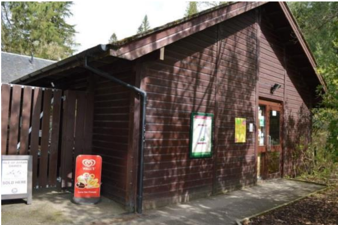
Above: The visitor centre entrance

The main route to the Garden is through the visitor centre and there is level access from the car park to the entrance. A welcome panel outside the entrance way provides information about the Garden including the easy access route. The visitor centre entrance door is 850mm clear opening with 1500mm clear spaces opposite the door.