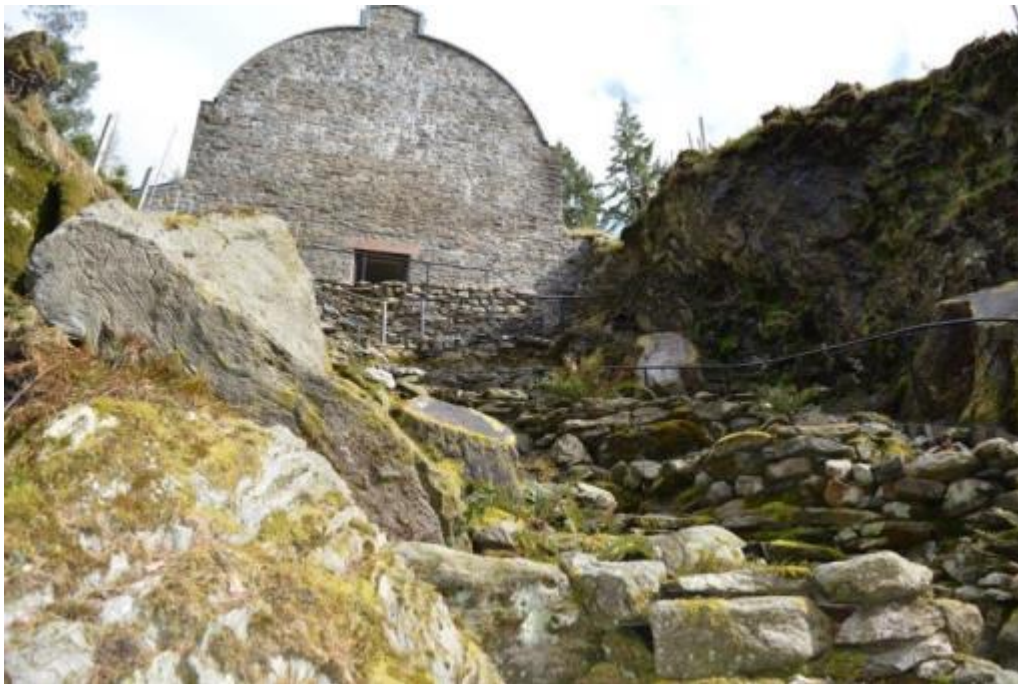
Above: The stepped approach to the Victorian Fernery.

The Victorian Fernery is beautifully restored and worth a visit. However, it is not part of the Easy Access Route and there is a gradient of up to 1:4 leading to the entrance steps. There are 44 steps leading to the Fernery with a handrail to one side. There are a further 24 steps within the Fernery. Bench seating is provided inside. Assistance dogs are welcome.