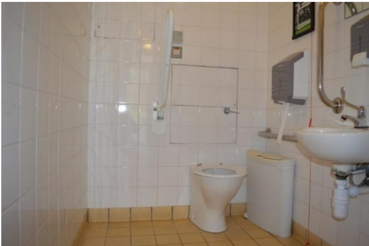
Above: The WC by the Courtyard Gallery.

The doors to this WC are 930mm minimum clear opening with clear space opposite the doors. The floor space is 1200 x 1200mm and there is 700mm lateral transfer space to the left of the WC. The height of the WC is 420mm to the top of the seat.