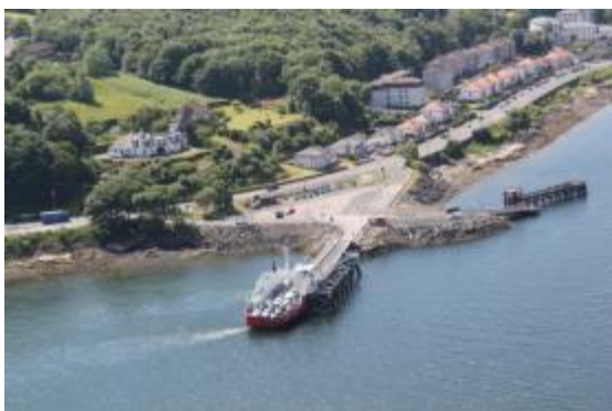
Above: McInroy's Point, Gourock