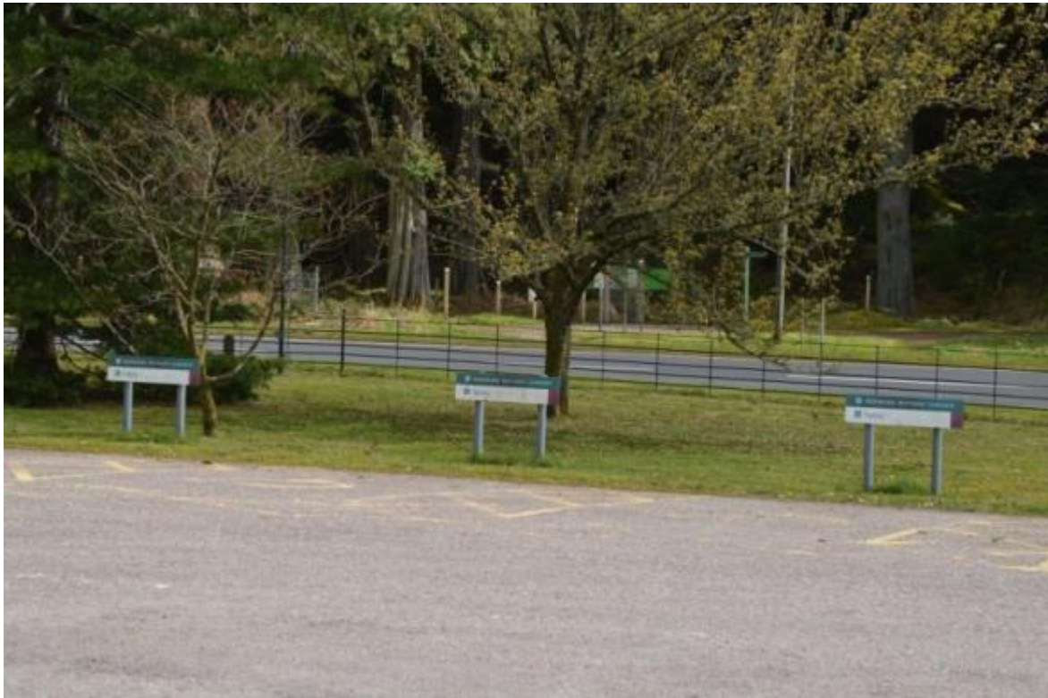
Above: Spaces for blue badge holders to the right of the visitor centre, facing the road.