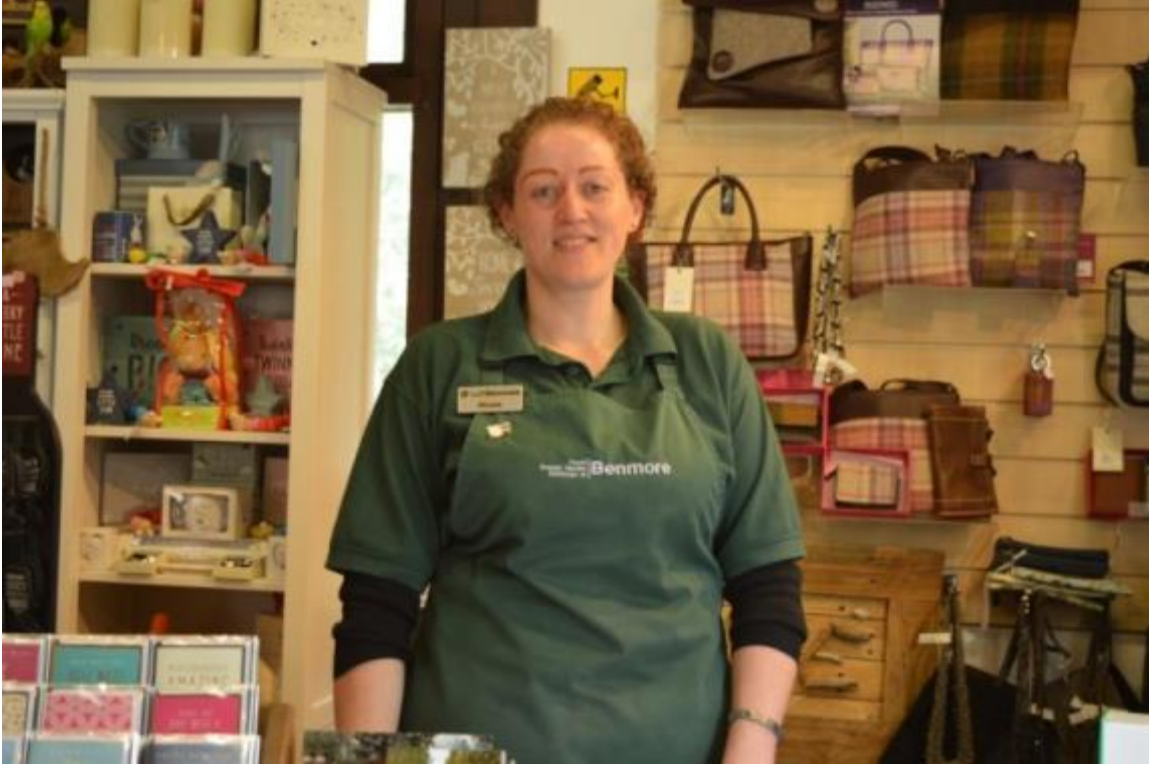
Above: A warm welcome is guaranteed at our Information Desk where your ticket and Garden Map can be purchased.