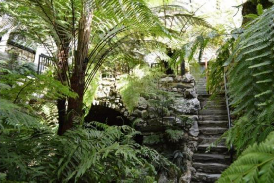
Above and below: Inside the Victorian Fernery where benches are provided.