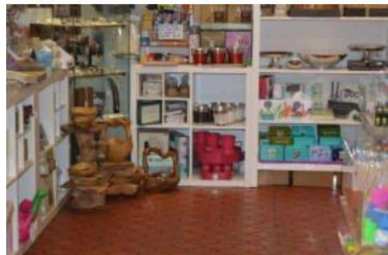
Above: The shop space is small but provides space for visitors to browse.