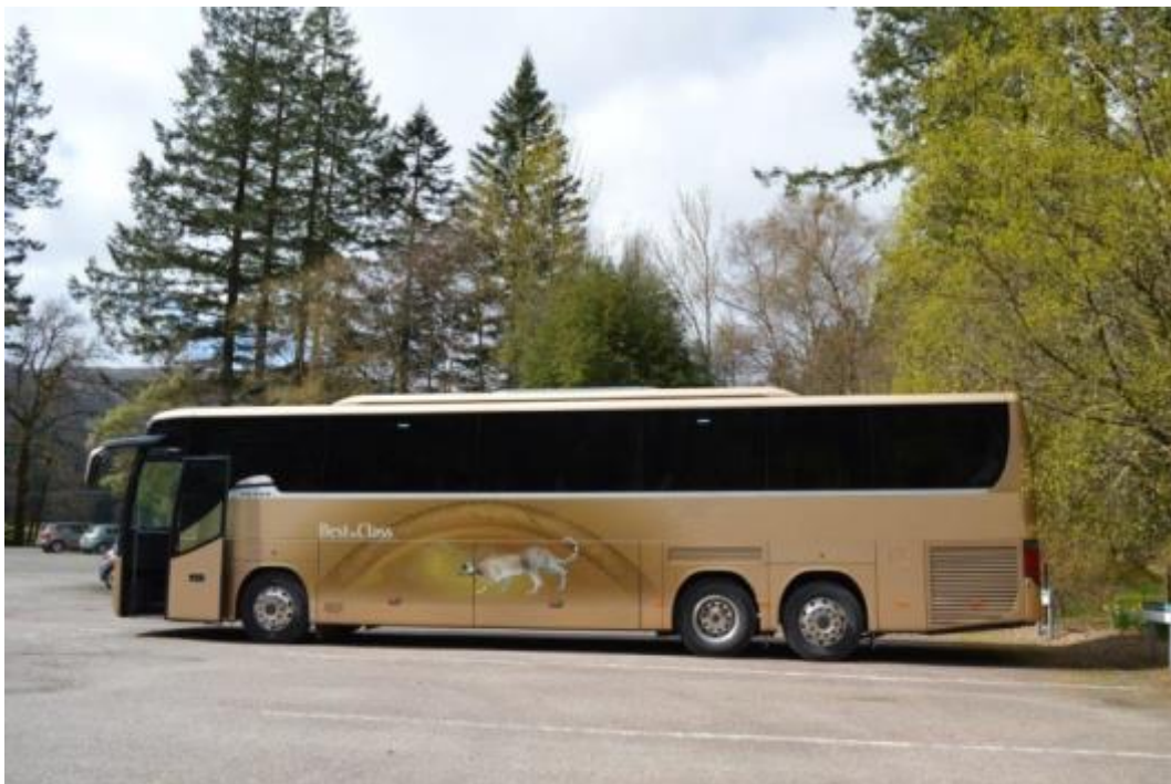
Above: Ample parking provided for coaches.