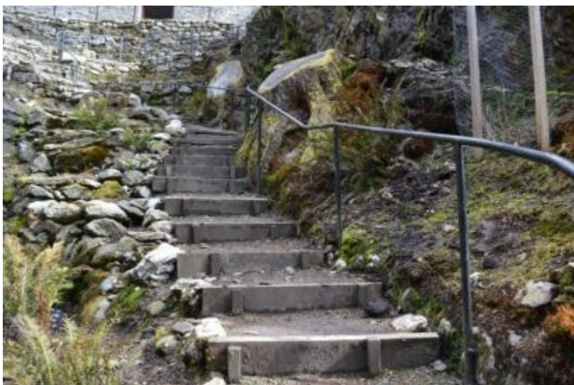
Above: 44 steps lead to the entrance.