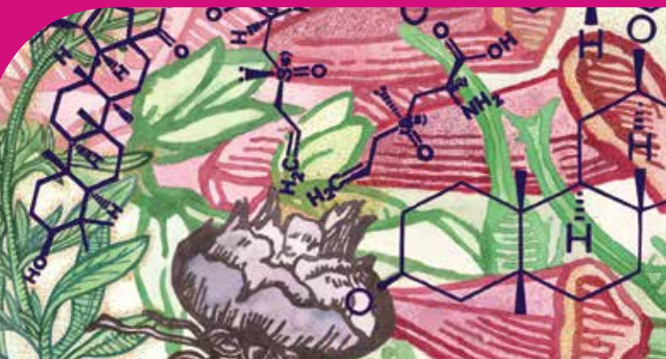
Physic Garden Tapestry, sketch by Natalie Taylor