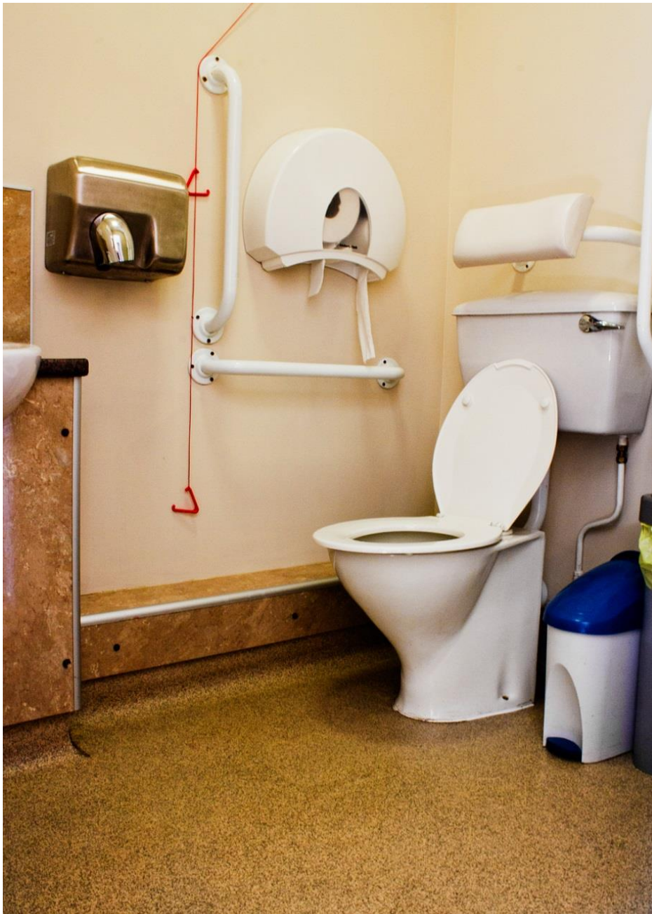
Above: The accessible toilet at Logan Botanic Garden

There is an accessible toilet in the public WC building near the Garden entrance. Entry is easiest from the outside of the building. Note that there is a slight incline to the entrance. Doors to the WC are 800mm clear opening with a 1200mm clear space opposite the door. Three steps leading down to the WCs from the Potting Shed Bistro make access from the restaurant a challenge for disabled visitors. Note that these steps have highlighted nosings and a handrail to one side.