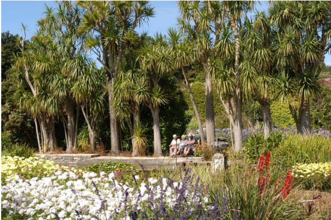
Above and below: Benches are positioned in many locations around the Garden.

A range of bench seating is provided at regular intervals around the Garden in all locations. These provide visitors with an opportunity to take a break and rest with their companions.