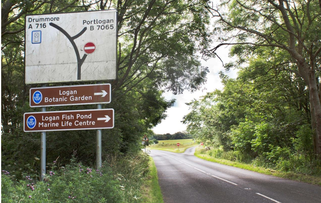
Above and below: The Garden is sign-posted from the A716.