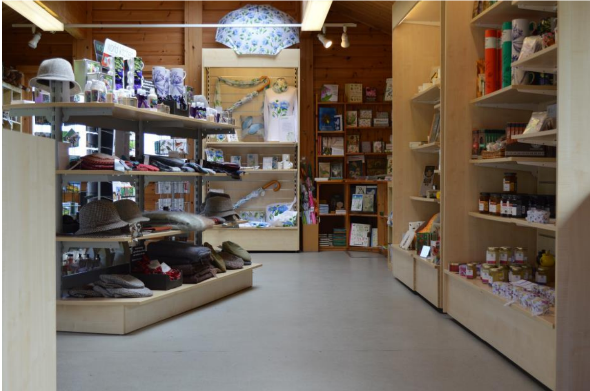
Above: Wide aisles in the shop.

There is a shop in the reception area as you enter and exit Logan Garden. It offers a wide range of quality gifts, souvenirs, books and plants.