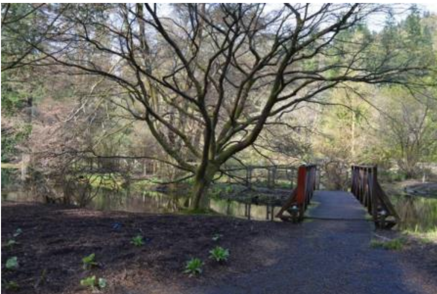
Above: The Pond's viewing point.