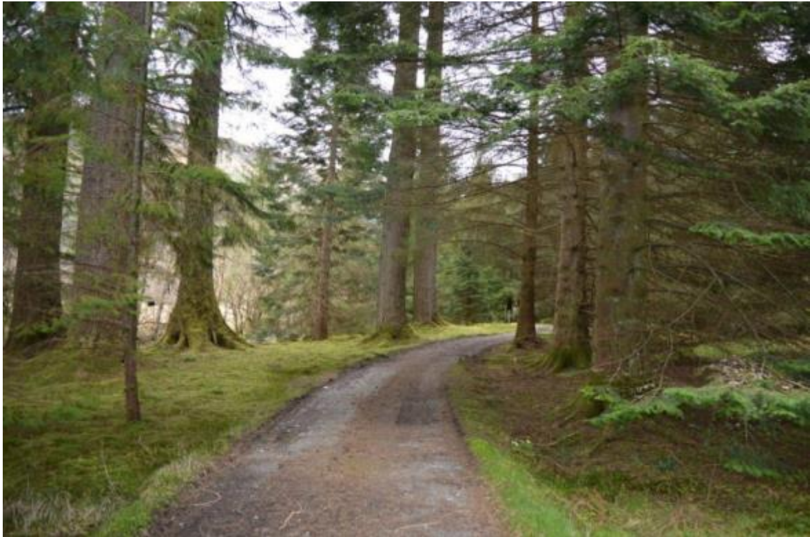
Above and below: Gravel paths on Benmore's accessible route. Note, that there are several speed bumps along the Easy Access Route.