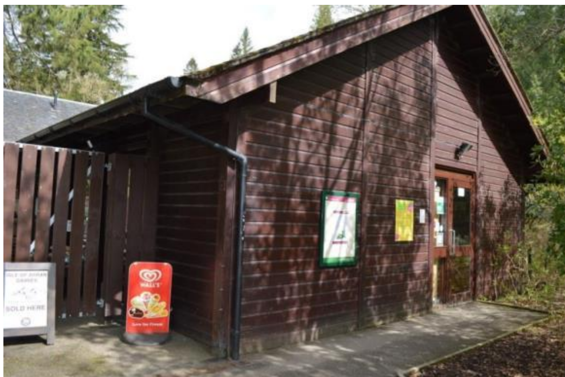
Above: The visitor centre entrance

The main route to the Garden is through the visitor centre and there is level access from the car park to the entrance. A welcome panel outside the entrance way provides information about the Garden including the easy access route. The visitor centre entrance door is 850mm clear opening with 1500mm clear spaces opposite the door.