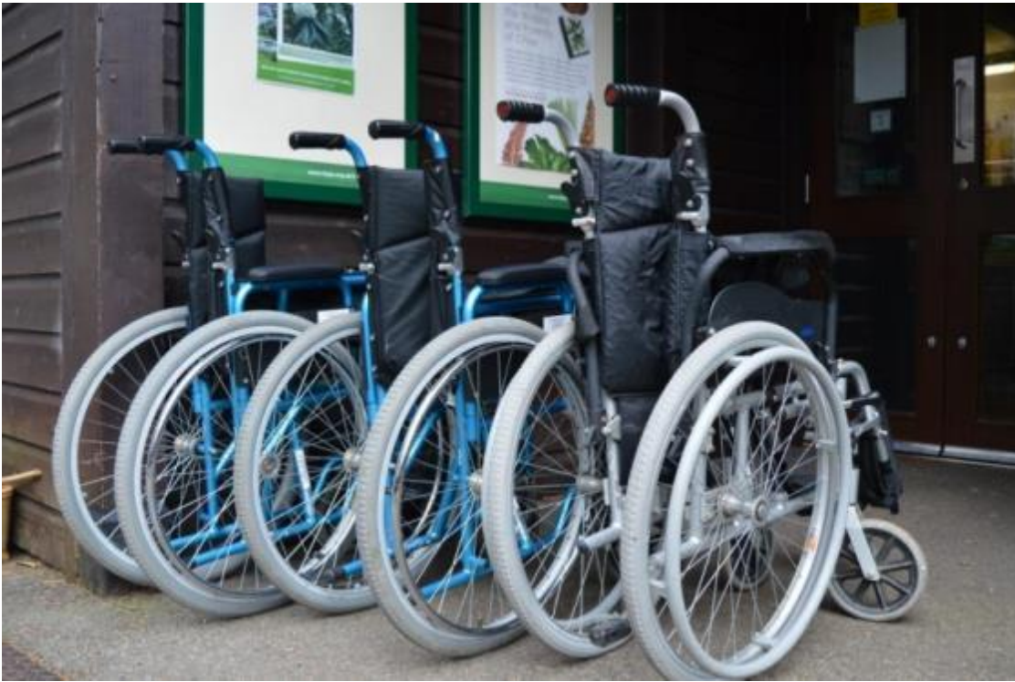
Above: The visitor centre has three wheelchairs for visitors to use. If possible, please book in advance by calling 01369 706261.