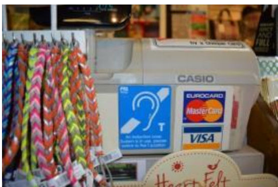
Above: Hearing loop at the counter.