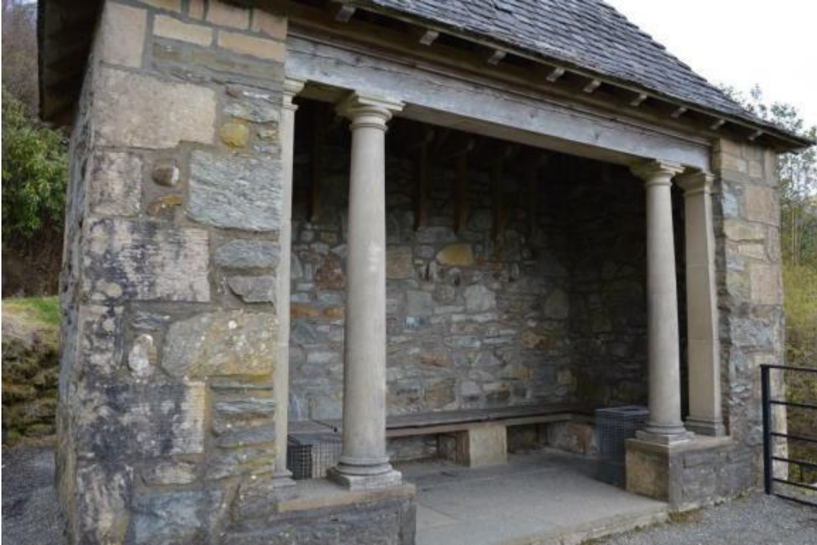
Viewpoint and Shelter (Wright Smith Memorial) 137m (450 ft) above sea level and accessed via a series of paths and steps. From here it is possible to see Holy Loch and the tops of neighbouring mountains.