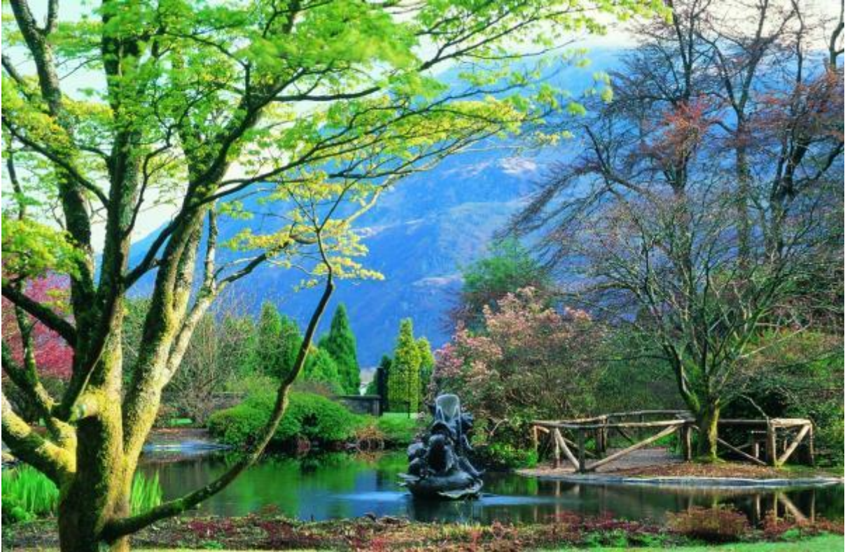
Above: The Pond is set amidst dramatic landscapes and on the Easy Access Route. Manual wheelchair users may need help with thresholds to reach the Pond's viewing stage.