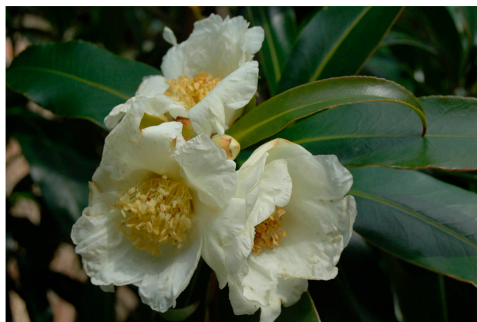
Fig. 6 Polyspora speciosa collected from Phan Xi Pang, a mountain in northern Vietnam, collection number HNE 107.

In the Walled Garden, beds have been renovated with a combination of soil amelioration, mulching and new plantings. A new peat wall area has been created to reflect Logan's history, as peat gardening was a passion of the McDouall brothers, the founders of the Garden.