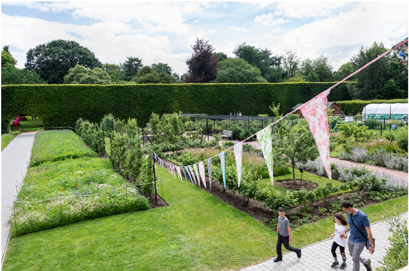
Fig. 3 The fruit-growing area of the Demonstration Garden.