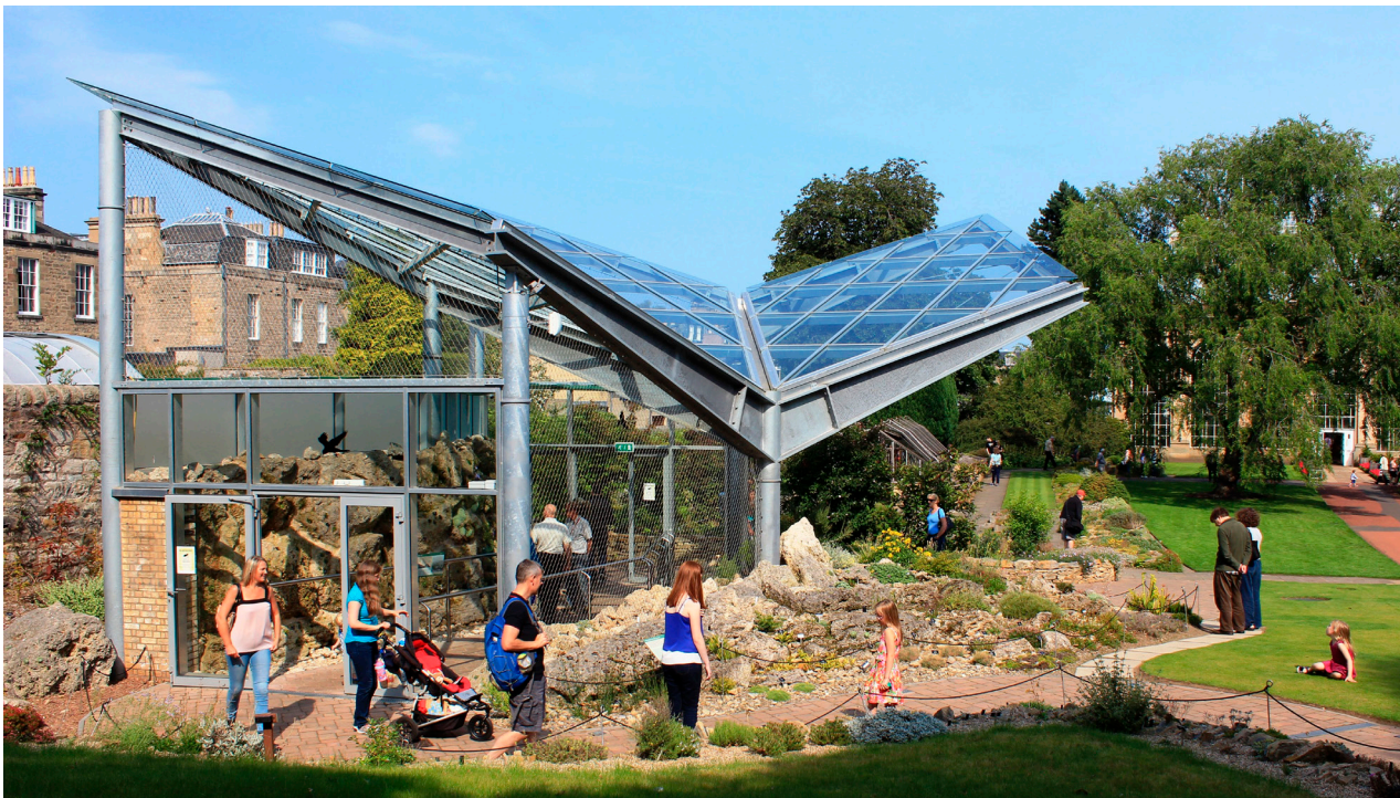
Fig. 4 The new Alpine House.

In early spring the tufa wall is a riot of colour with the flowers of Primula allionii , Daphne petraea , Draba spp., saxifrages and Dionysia spp. Later in the season Physoplexis spp., Campanula spp. and Corallodiscus spp. flower profusely. The new Alpine House sits next to the refurbished traditional Alpine House and visitors can see and compare the wide range of techniques used to grow the plants as well as appreciating the variety and beauty of species that occur in alpine habitats.