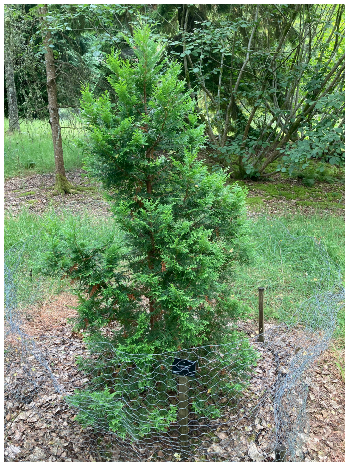
Fig. 5 Austrocedrus chilensis planted in 2014 at the Viewpoint and protected from deer damage.

More general restocking of the plant collections is a yearly task and is often linked to periods of severe weather and associated losses therein, or through natural wastage or removal of moribund specimens. Systematic replanting has been carried out and has seen new acquisitions of Acer , Betula , Prunus , Sorbus , Juniperus and Rhododendron from a number of different RBGE expeditions including DBT, REKET, CBDK, MADDT, EIKJE and EIJE. Work undertaken to bolster Dawyck's significant holdings of Nepalese plant material has also seen the planting of species of Cotoneaster , Berberis and Rosa from BRAW.