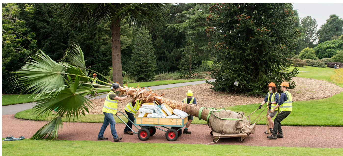
Fig. 1 The largest palm to be moved from the Temperate Palm House to a temporary home was Livistona humilis. It took several days of digging, wrapping, hiring specialist equipment, and coordinating people and machinery to get it into a 1,400-litre pot in the Temperate House in the Front Range.