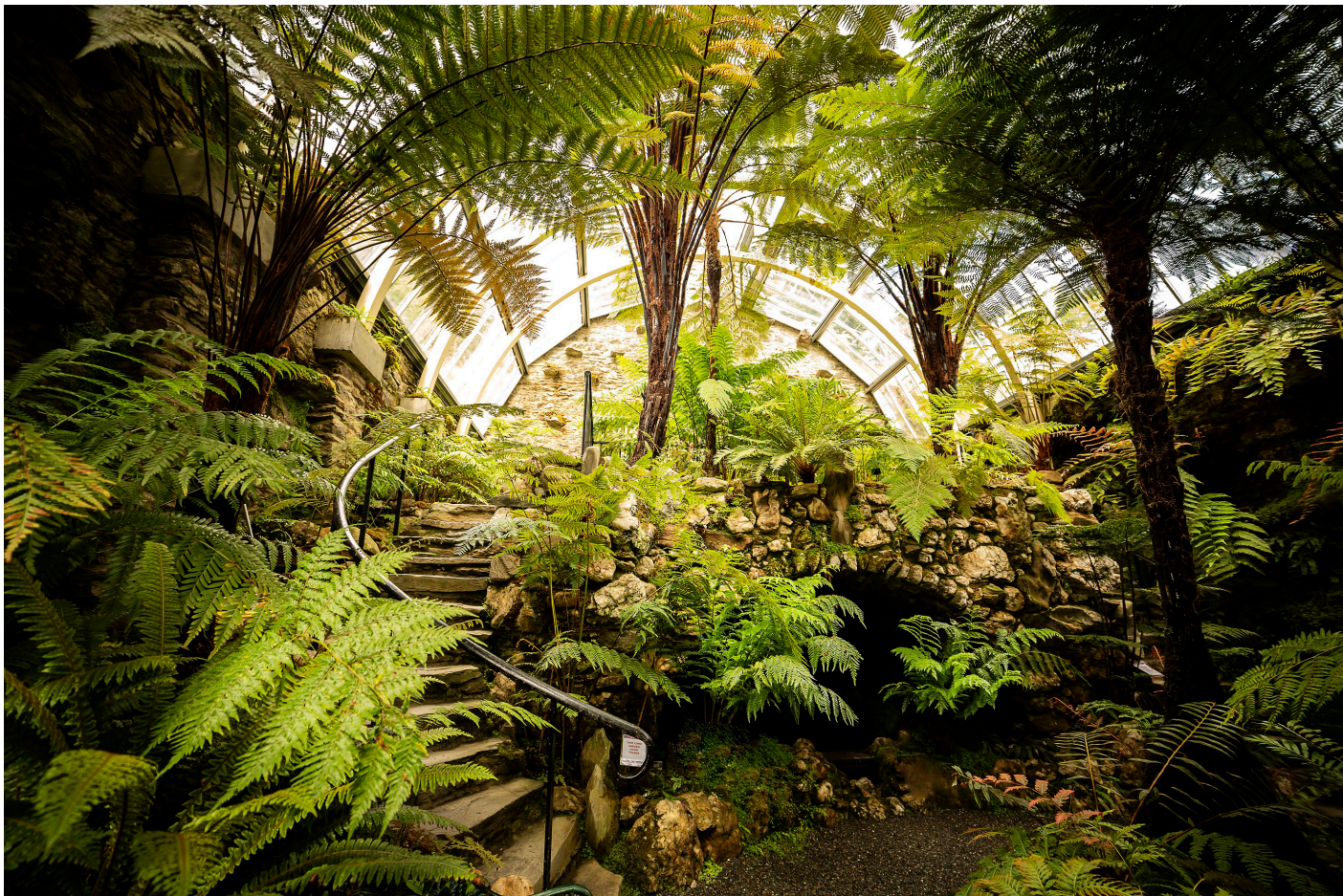
Fig. 8 The Fernery.

GRAY, D. (2017). Deer damage to woody plants – the Benmore solution. Sibbaldia , 15: 109–121. doi: https://doi.org/10.24823/Sibbaldia.2017.226