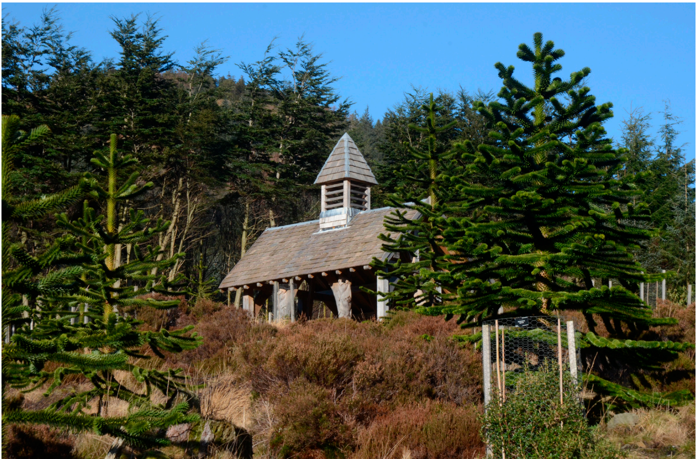
Fig. 7 The Chilean Refuge and Araucaria araucana .

The shelters, Fernery and Golden Gates have created 'go to' destinations within the Garden and have enhanced the cultural identities of the plantings in the phytogeographic areas. There are now chortens at the