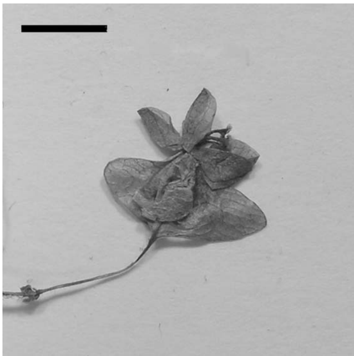
FIG. 3. Female flower and developing fruit, taken from holotype. Scale bar represents 1 cm.